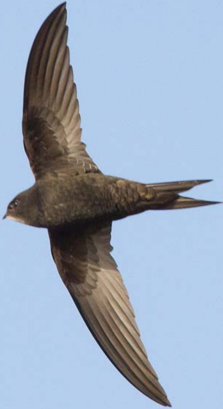
Swift in flight by Flickr user Langham Birder http://flic.kr/p/bUgr4U Creative Commons licence. Some rights reserved.